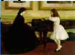
At The Piano

"Art should be independent of all claptrap-- should stand alone, and appeal to the artistic sense of eye or ear, without confounding this with emotions entirely foreign to it, as devotion, pity, love, patriotism, and the like. All these have no kind of concern with it, and that is why I insist on calling my works "arrangements" and "harmonies".