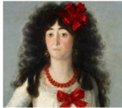
Francisco de Goya y Lucientes, The Duchess of Alba in White , 1795

7:00 Museum opens for a continental breakfast. 7:45 MSU bus leaves from the Wichita Falls Museum of Art. 10:15 Meadows Museum for exhibition titled Treasures from the House of Alba: 500 Years of Art and Collecting . We will see a thematic display of art (some leaving Spain for the first time) from the fifteenth and sixteenth centuries up to the end of the twentieth century collected by the Alba family, an important aristocratic lineage in Europe. 11:45 To the North Park Center where you have lunch on your own. 1:15 We will see the Art Meets Fashion: 1965 – 2015 exhibit from the Texas Fashion Collection at the University of North Texas featuring the last 50 years of fashion. Also a self-guided tour of the Center's acclaimed 20th and 21st century art collection that will turn your shopping into a world-class cultural experience! 3:30 Board the bus for home with complimentary wine and snacks. Arrive home by 6:00 PM.