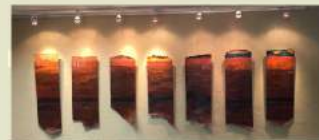
Jim Weaver: June 15 - August 20