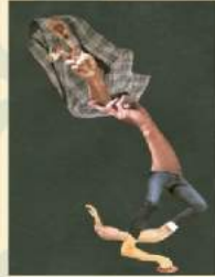
Yeager Edwards: Textiles and Collage May 1 - June 10, 2018