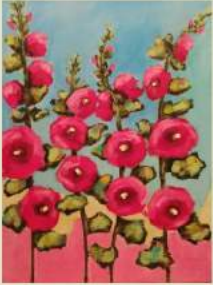
Yvonne Sternadel: May 18 - July 21