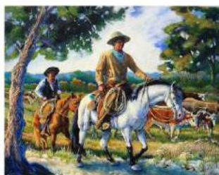
2nd Place Painting (tie) Cynthia Westbrook "Almost to Red River"