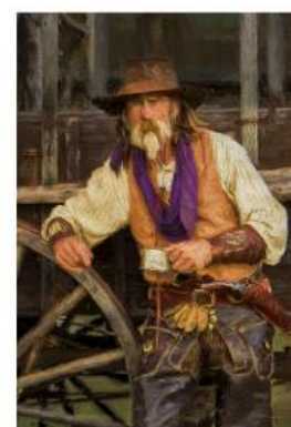
2nd Place Photography/Digital Art Jack Milchanowski "Break Time"