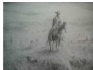
First Place Drawing Bill Whitely "The Texian"