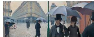
Gustave Caillebotte, Paris Street, 1877

Kemp Center for the Arts & Wichita Falls Museum of Art