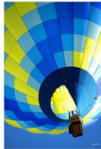
3rd Place Photography Jennifer Hammer "Blue on Blue"

In lieu of an October meeting, the CTAA hosted the Artist Reception for the Art of the Song Art Show.