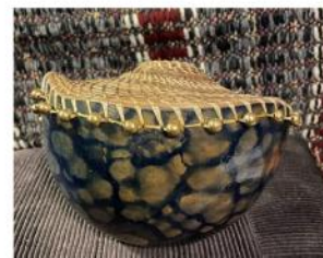
2nd Place Mixed Media / Glass Rich Mahaffey "Turtle Mountain Trail"