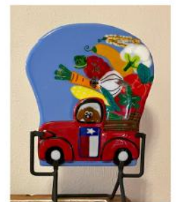
3rd Place Mixed Media / Glass Sharon Brown "Happy Harvest"