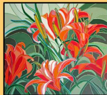
HONORABLE MENTION "Consider The Lilies" Acrylic Kay Wirz - Granbury, TX 36 x 40 | $1,600.00