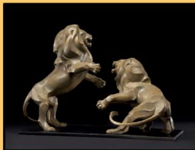
HONORABLE MENTION "The Challenge" Bronze Rosetta - Loveland, CO 22 x 15 x 12 | $6,700.00