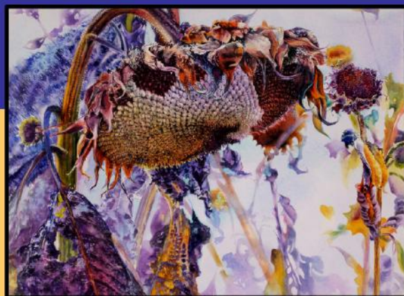
Clay PITZER MEMORIAL WINNER "Golden Age – Sunflower" Watercolor Soon Warren - Fort Worth, TX 30 x 22 | $6,000.00