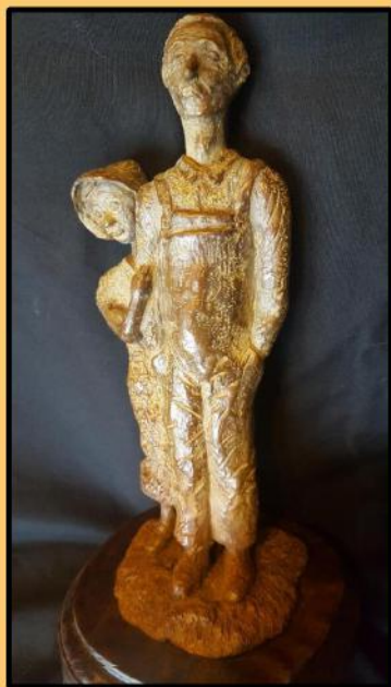
LESTER & VIRGINIA CLARK MEMORIAL WINNER "Dust Bowl Farmers" Bronze Jerry Smyers - Holliday, TX 6 x 12 x 5 | $1,200.00