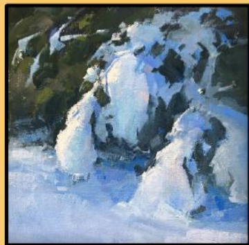
HONORABLE MENTION "Winter's Coat" Oil Bev Boren - Trophy Club, TX 12 x 12 | Not for Sale