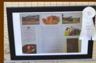
3rd Place Photograph Life's Railway to Heaven by Jesse Coulson