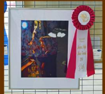
2nd Place Photograph Daddy Played Base by Willetta Cope Crowe